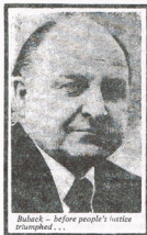
Buback - before people's justice triumphed...