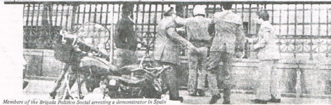
Members of the Brigada Político Social arresting a demonstrator in Spain

Massive support from outside Spain is needed to help the struggle. It didn't get it last time and it has never got it. With what result everyone knows to their cost.