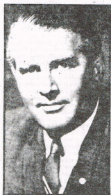
Werner Von Braun 1912-4000

Although Werner Von Braun is still alive, though bed-ridden with a terminal case of cancer, we feel that this is the appropriate time to wish him a speedy death.